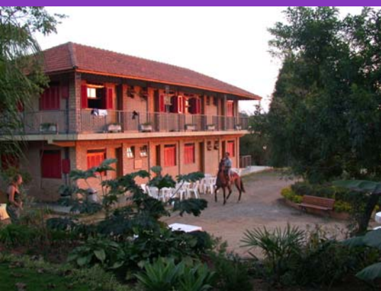
IPÊ Facilities in Nazaré Paulista

Students participating in the SEE-U Brazil course spend 5 weeks learning about tropical forest ecology and conservation practices in the Atlantic Forest. The Atlantic Forest is geographically and ecologically distinct from the Amazon Forest. The ecosystems within this region include evergreen tropical rainforests, semideciduous tropical forests, mangroves, and high-altitude grasslands. The Atlantic Forest is one of Conservation International's 35 Biodiversity Hotspots, exhibiting both floral and faunal biodiversity and home to over 20,000 species of plants and 2,200 species of mammals, birds, reptiles, and amphibians.