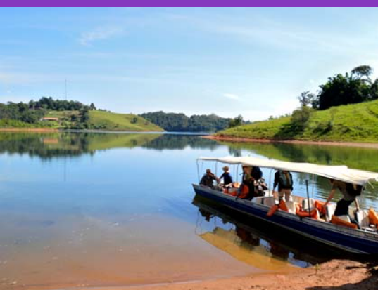
Local excursion, Rio Picinguaba