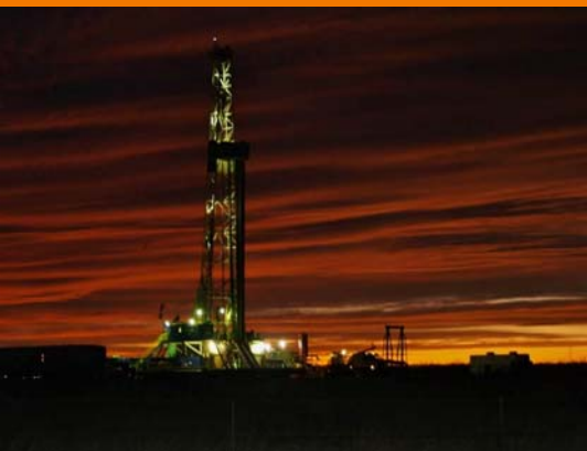
Energy development on public lands