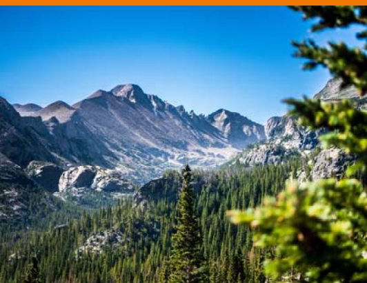
Rocky Mountain National Park

The American West is perhaps best known for the dramatic landscapes managed through a web of federal land management agencies. Indeed, Western states have a land base that is at least 35% public, and competing interests vie for limited resources and navigate a complex bureaucracy. Less well understood are the dynamics that arise from the interactions among different land ownership categories: federal, state, and private. Working landscapes are essential pieces of the cultural heartbeat of the region.