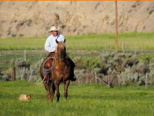
Working ranch in Rocky Mountains