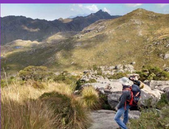
Itatiaia National Park

Students participating in the SEE-U Brazil course spend 5 weeks learning about tropical forest ecology and conservation practices in the Atlantic Forest. The Atlantic Forest is geographically and ecologically distinct from the Amazon Forest. The ecosystems within this region include evergreen tropical rainforests, semideciduous tropical forests, mangroves, and high-altitude grasslands. The Atlantic Forest is one of Conservation International's 35 Biodiversity Hotspots, exhibiting both floral and faunal biodiversity and home to over 20,000 species of plants and 2,200 species of mammals, birds, reptiles, and amphibians.