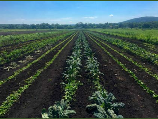
Blooming Hill Farm, NY