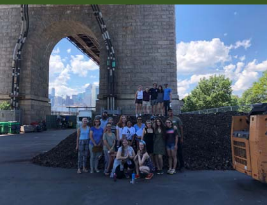
BIGReuse, Queens, NY

The SEE-U NYC course provides students an opportunity to examine in-depth agroecosystems. The course makes use of the diverse array of farms and food systems in New York City and its surrounding environs. Lectures introduce students to the foundations of ecosystem ecology and conservation, focusing on agroecosystems such as farms, rooftop operations, pastures, grazing lands, orchards, and plantations.