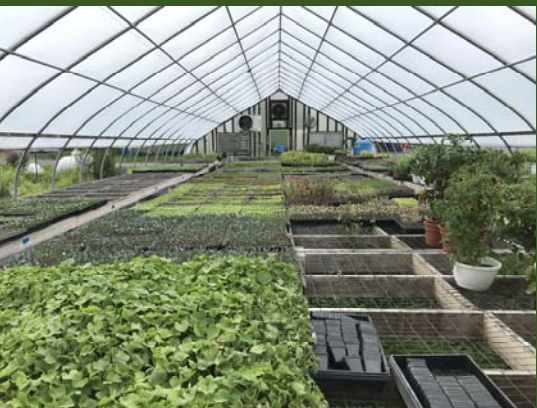
Rise & Root Farm, NY