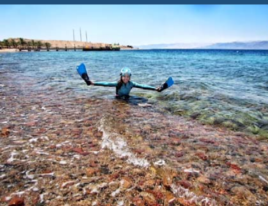
Tala Bay, Aqaba

Through a partnership between EICES and The Columbia Global Centers | Middle East, the SEEU Jordan course provides students with a unique opportunity to study ecosystems, biodiversity, and environmental sustainability in Jordan. Participants in the course learn about marine, desert, and forest ecosystems while traveling the length of the entire country, from Amman in the north to Aqaba in the south.